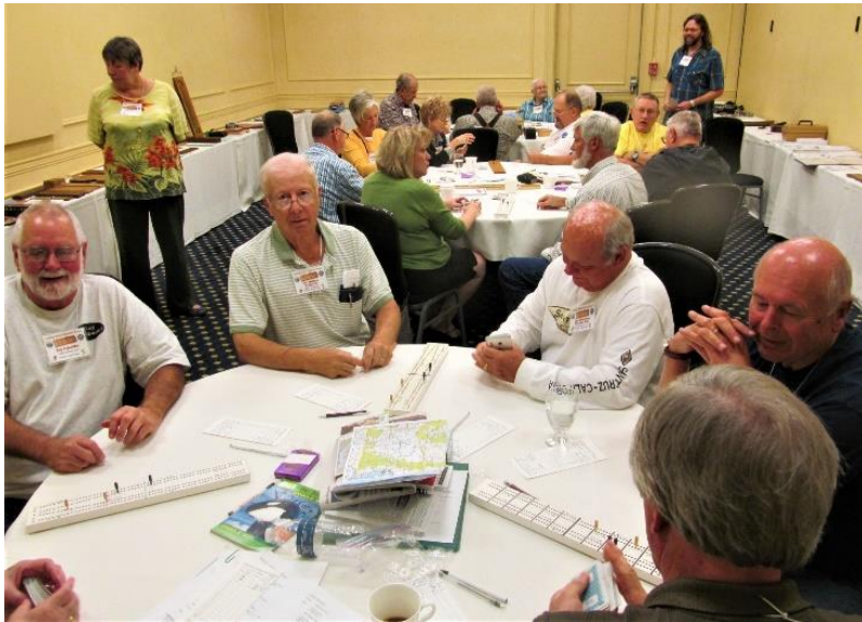
Typical cribbage tournament in convention room

During the afternoons on Friday and Saturday, there is a thirteen-game tournament. There are no official pairings; you simply play one game and then look for someone else whom you have not yet challenged until you complete ten games. Scoring of the tournament is like that of the ACC: 0 pts for a loss, 2 points for a win, and 3 pts (rather than 2) for a skunk win. Top three or four places are rewarded with a certificate and/or a special cribbage board. It is voluntary, fun, and friendly, although some “ribbing” may occur! Our reigning 2019 Champion is Larry Snow